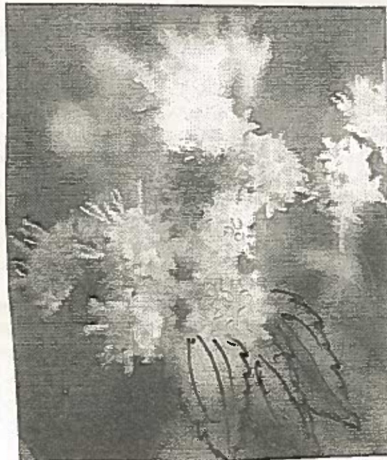
Eupatorium rugosum, flowers