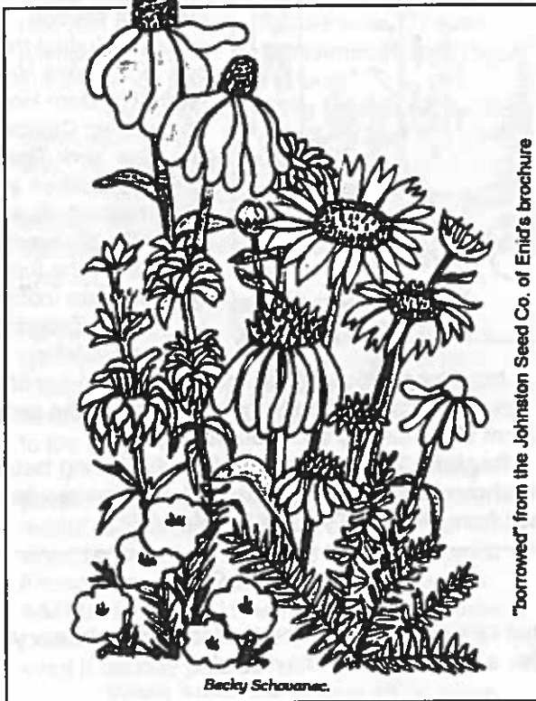
"Borrowed" from the Johnston Seed Co. of Enid's brochure