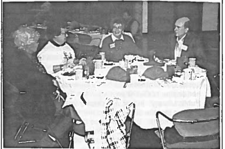
Luncheon at Phillips University during Indoor Outing

indoor meeting place, Kirkpatrick Horticulture Center, at