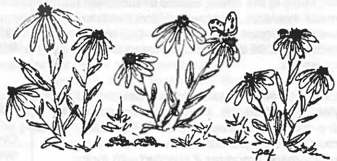
Echinacea spp. The next endangered species? See pp 8-9